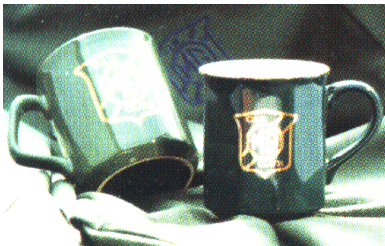
Octogonal Mug – $12