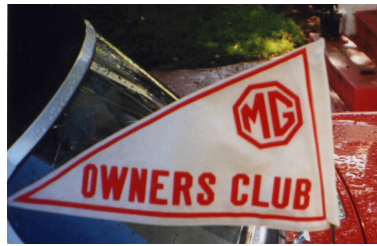
Pennant – $10