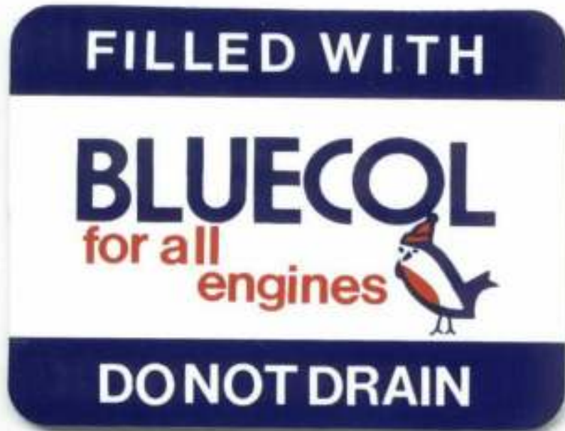
The missing decal.