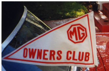
Pennant — $10