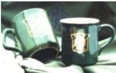
Octogonal Mug — $12