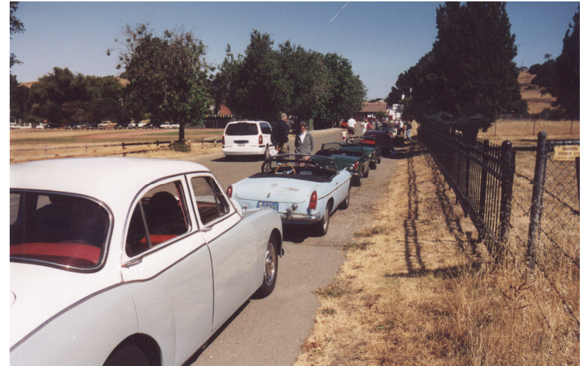
MGs line up for the Pelican Inn.

July 15, 2001 (Sun)