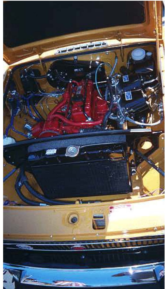
The engine compartment of Jerry Wiggins' 1971 MG.