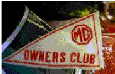
Pennant — $10