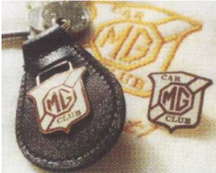
Key Fob — $10; Pin — $6.50