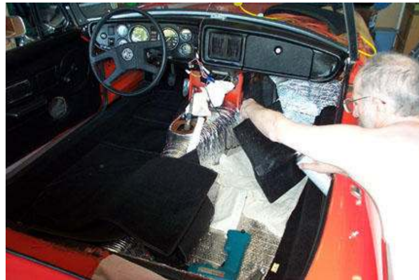
Installing new carpets in the 1979 MGB.