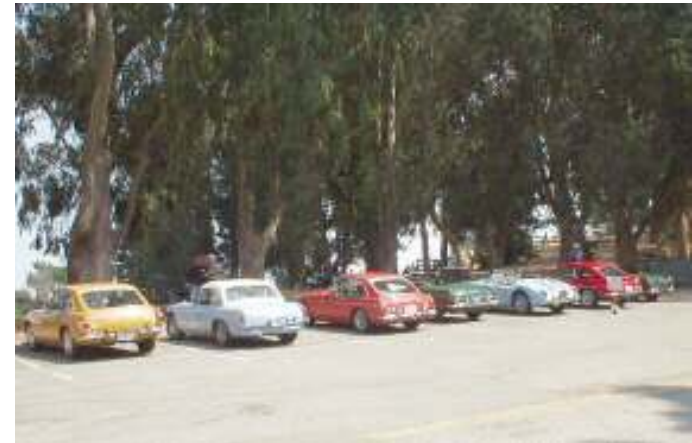
MGs at the MGOC Annual Picnic.

MGOC-OCTAGON If undeliverable please return to: 320 B Monterey Blvd., San Francisco, CA 94131-3141 email: mgoc@felixwong.com http://home.nacbell.net/tensten