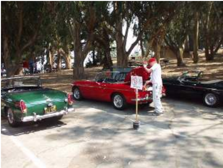
Some MGBs. The red one in the center won an award.

tolerate! People's Choice awards in six classes. Join your British car friends for a smashing day at the park.