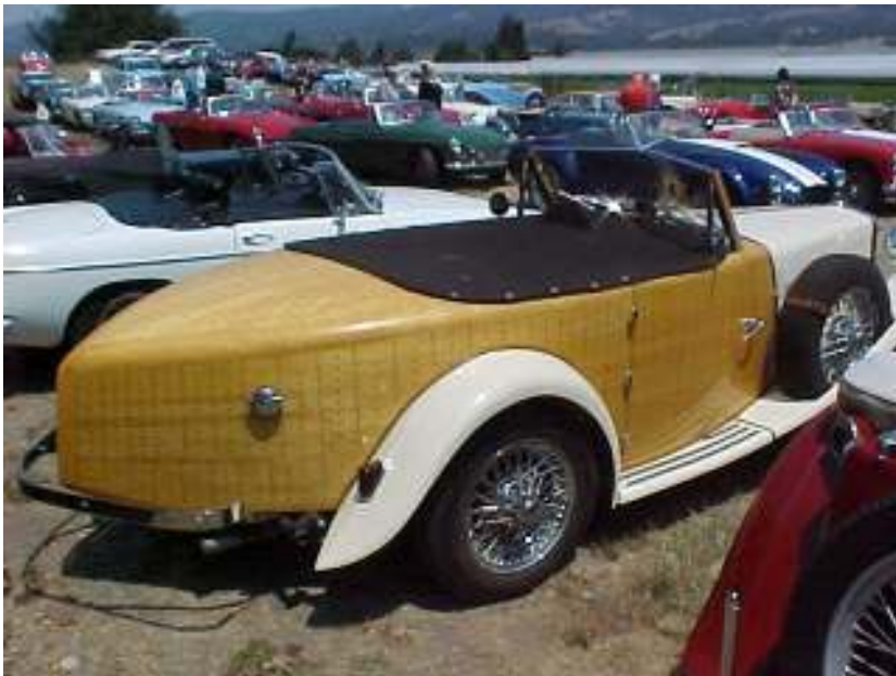
A very nice custom TD?