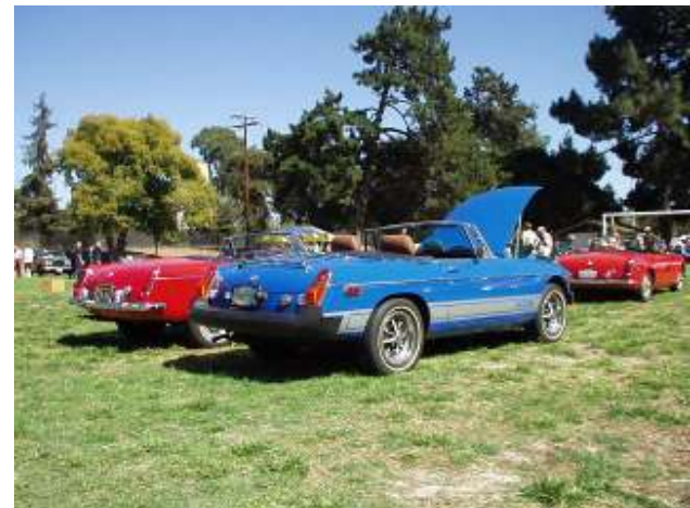
MGBs at the 2002 Palo Alto All-British Car Meet.