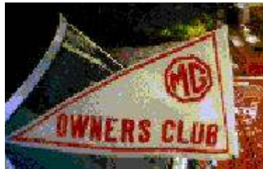
Pennant — $10