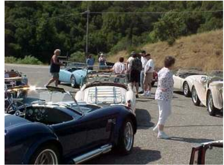
All lined up: row of British cars, including MGAs, TCs... even a Cobra!