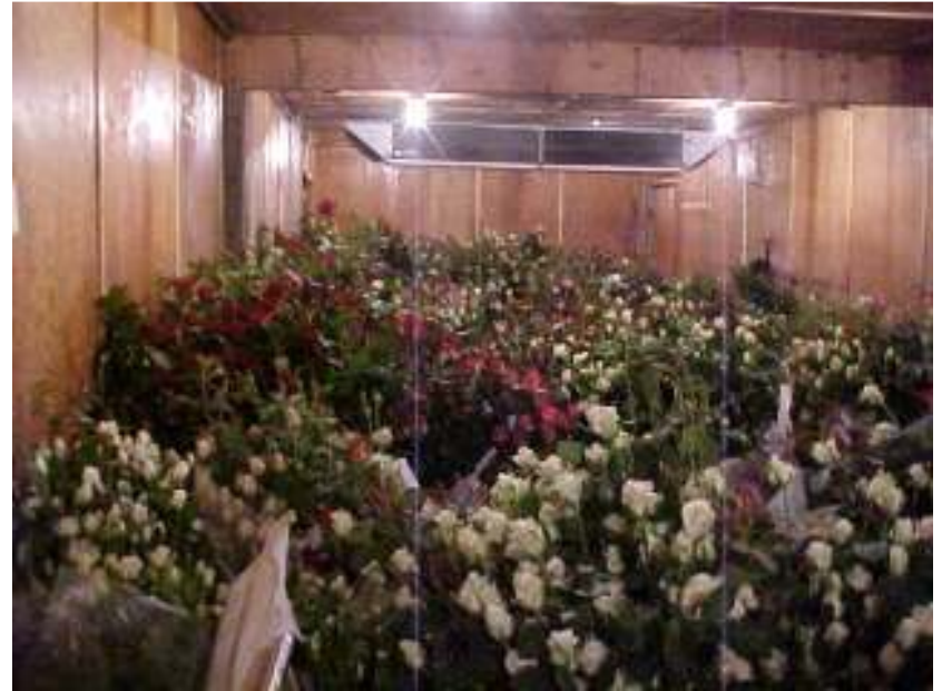
The roses in the tour.