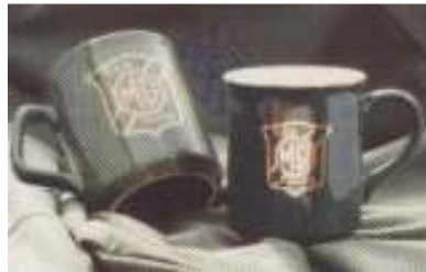
Octogonal Mug — NLA Round Mug — $10