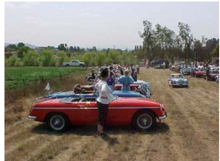
An Austin-Healey coming down the line, with other British car enthusiasts looking on.